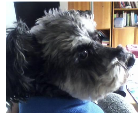
Niki - my mini-schnauzer

I have been making pet owners and their pets happy for more than six years in Spokane.