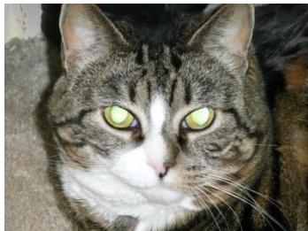
Mimi - my BIG cat

I look forward to meeting you and your pets! Thank you for choosing South Hill Pet Sitting for your pet sitting needs!