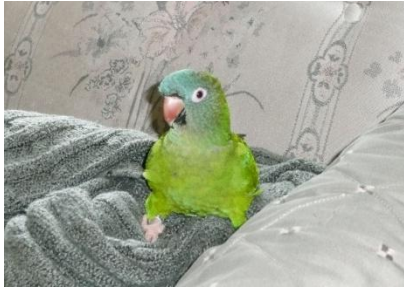
Connor - my blue crowned conure

Call me as soon as possible when you have your vacation plans, as I may have limited openings.